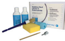
Stainless Steel Cleaner Kit

For shearing stainless steel cables up to 1/4" diameter.