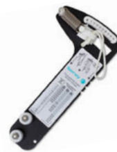
Cable Tension Gauge

Clean and maintain all stainless steel surfaces, fittings, and cables.