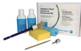
Stainless Steel Cleaner Kit

For shearing stainless steel cables up to 1/4" diameter.